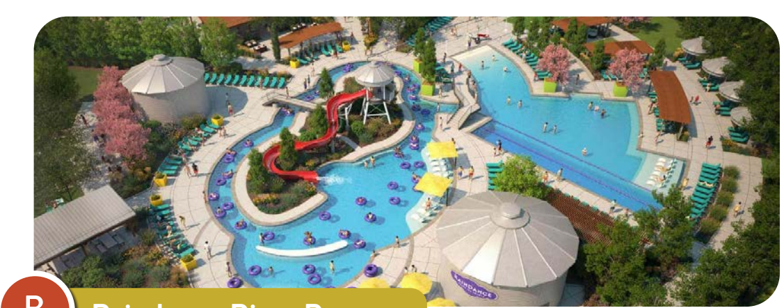
B Raindance River Resort