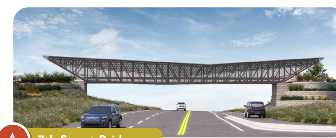
A 7th Street Bridge